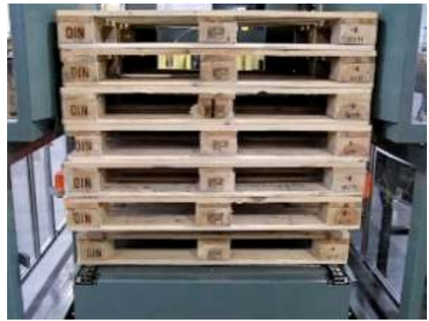
Automatic Pallet Dispenser