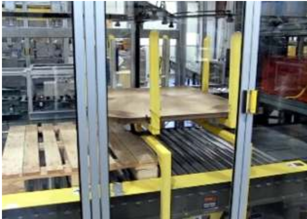
Flow Through Pallet Conveyor with Optional Deck Sheet Placement System